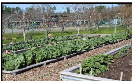
Beautiful flowers bloom in the Montford garden (top). A harvest of green vegetables flourishes (bottom).