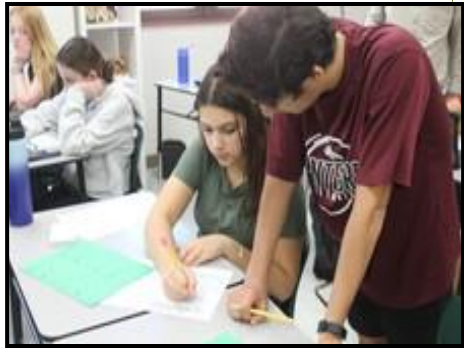
Students work through one of the complex escape room puzzles.

On Friday, January 20 th , Mrs. Famularo's algebra class did an escape room activity. Students were placed on different teams. Through three levels of math puzzles, each team tried to "escape" by solving equations and entering an answer code online. Mrs. Famularo did not only set up the escape room to get her students to do algebra, she also did this to get students